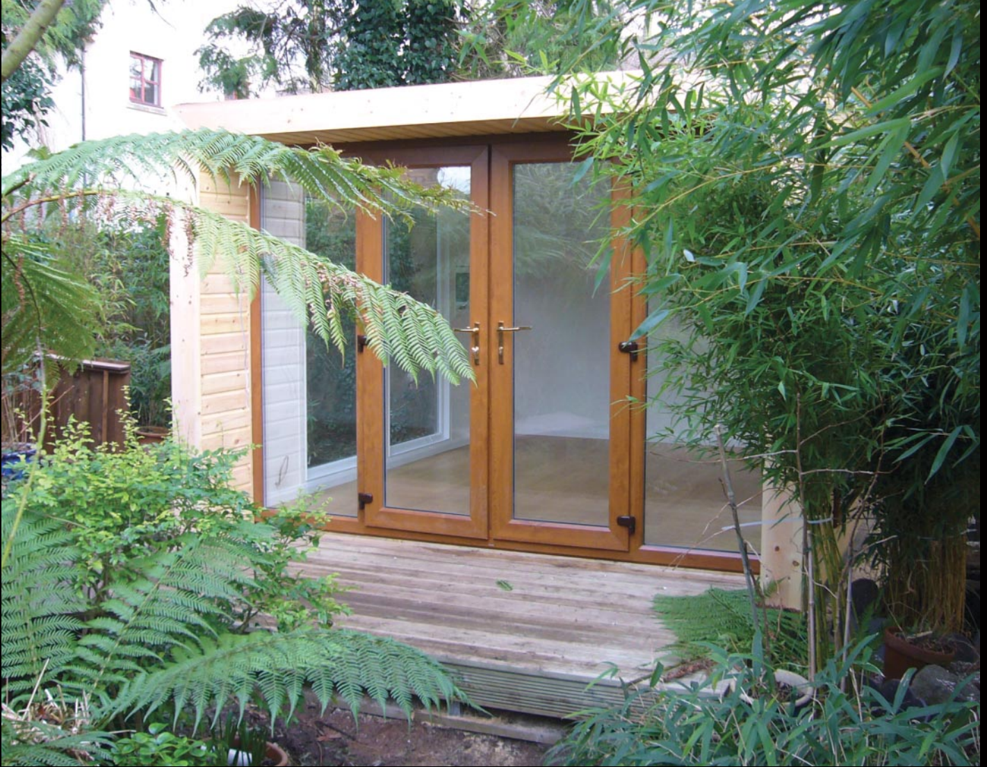
The Chatsworth with French Window Combination and Two Picture Window Option